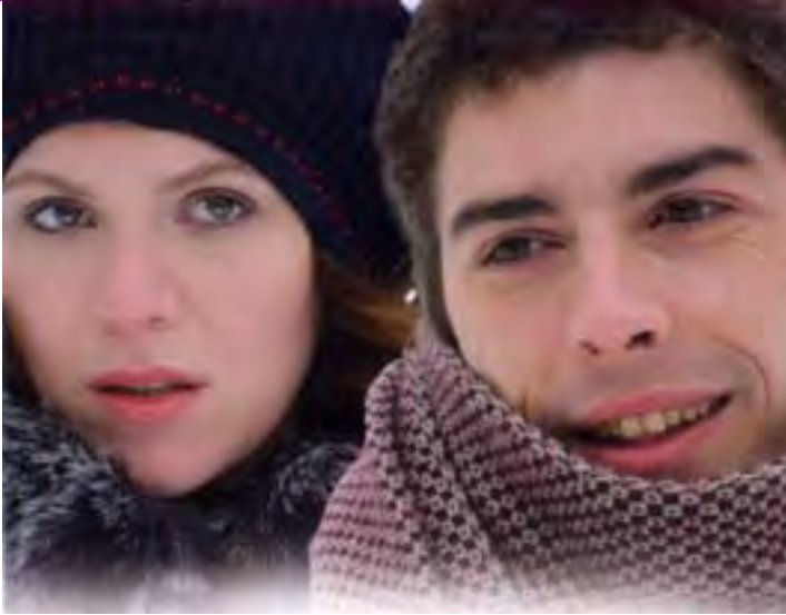
Dieci Inverni , 2009 – Production Company: Raicinema