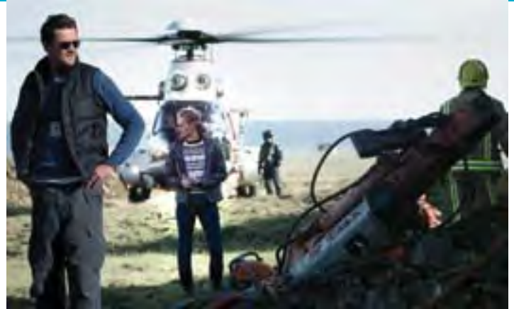
Both of these images are from The Cliff (Hamarinn) , 2009. Production Company: Pegasus.