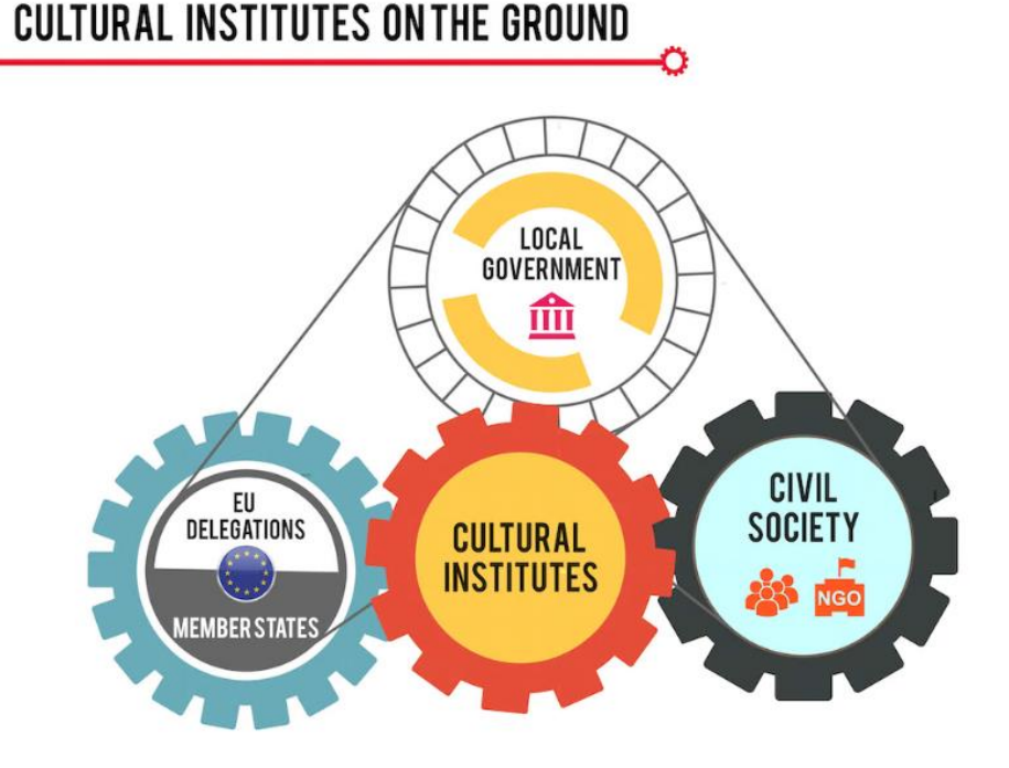
Figure 4: Cultural Institutes on the ground