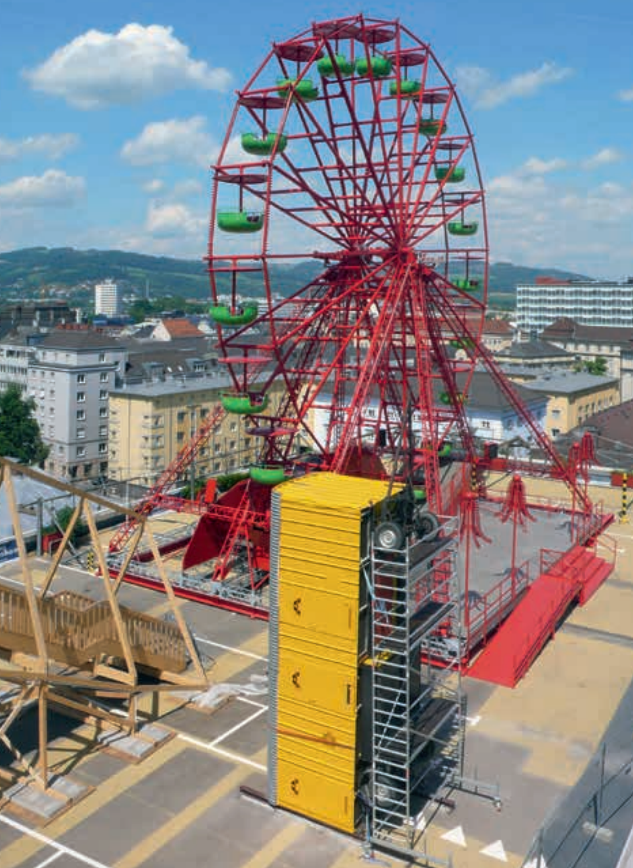
Linz 2009 — Höhenrausch — photographer: Andreas Strauss