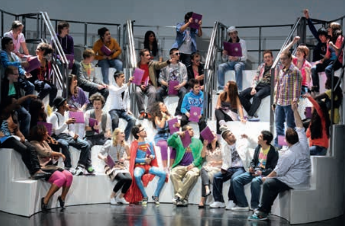
Essen for the Ruhr 2010 — TWINS project, Next Generation