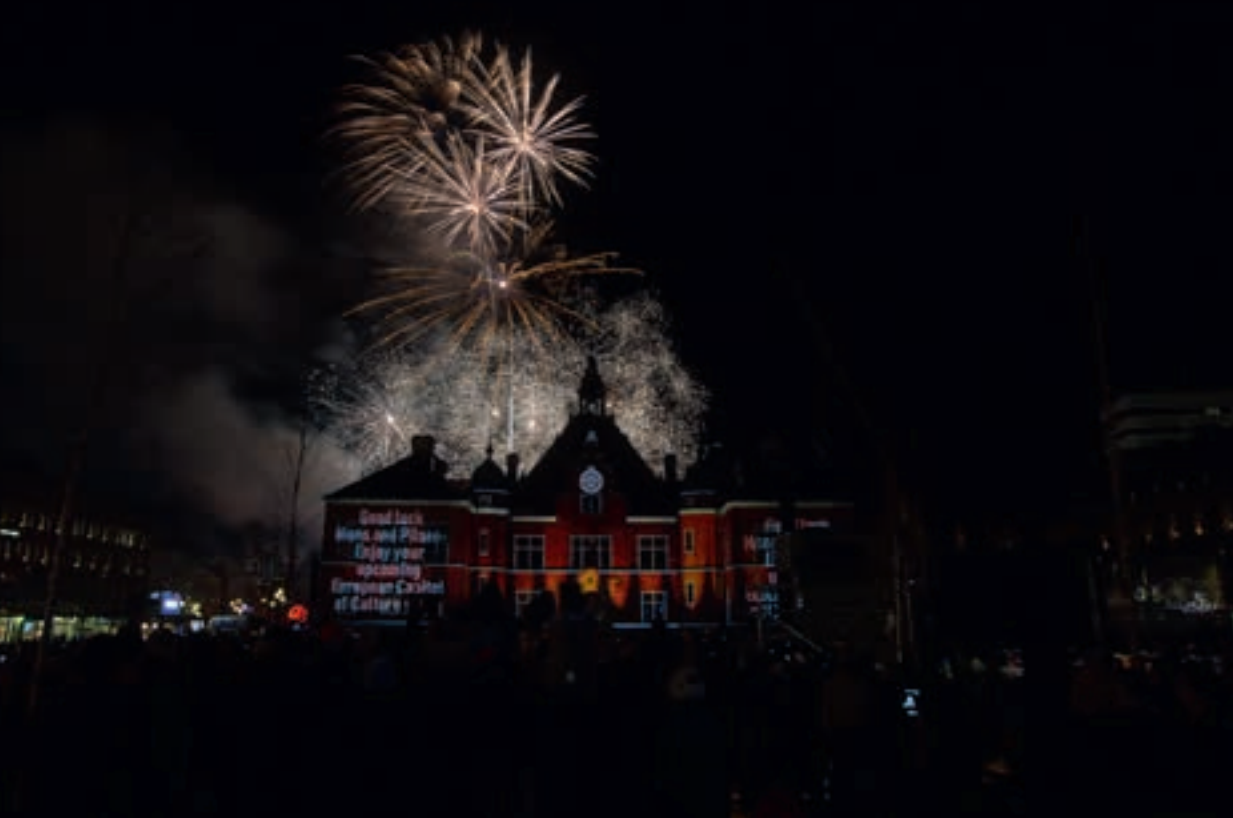
Umeå 2014 — Closing ceremony, Northern light