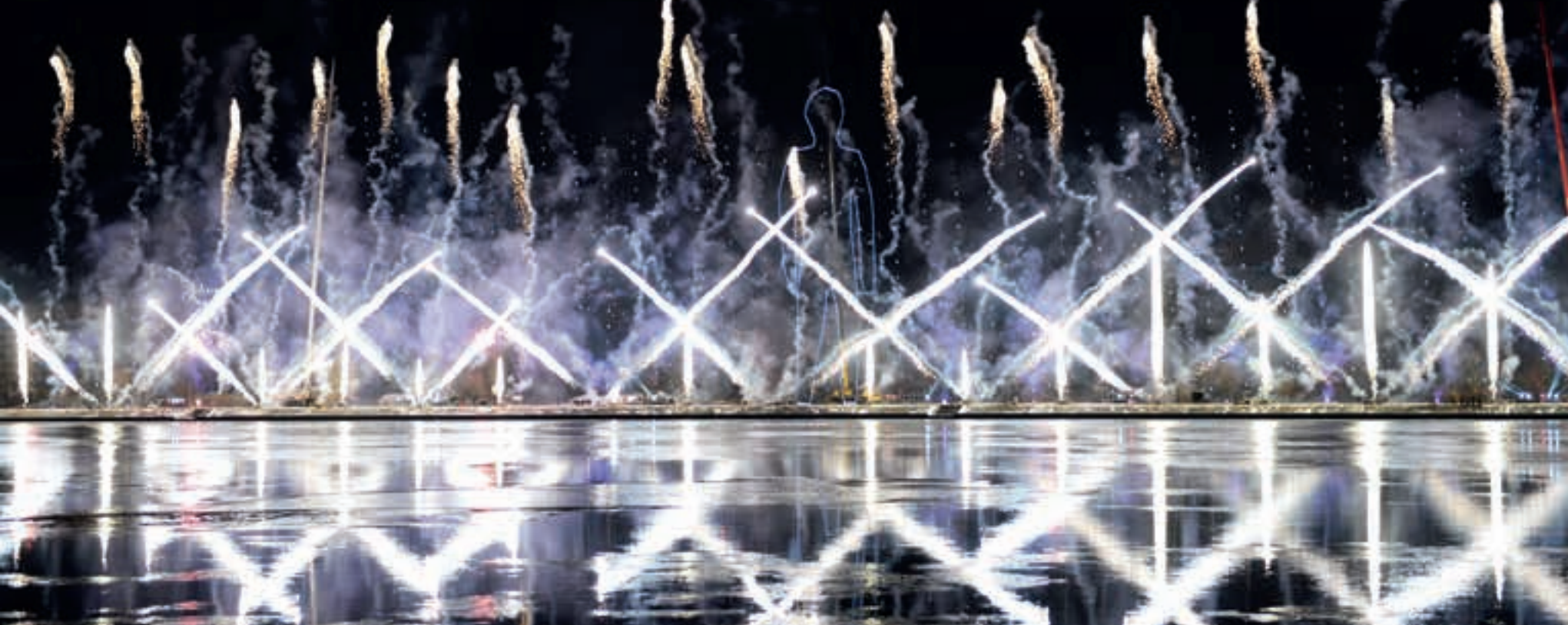
Riga 2014 — Musical light show

based on a pre-existing geographical, historical or more personal links. The European dimension can also be explored through developing European themes and issues or celebrating aspects of European history, identity, shared values and heritage. Sometimes this has taken the form of presenting old themes in fresh ways, or revealing hidden aspects of a European connection — or even tackling difficult themes that resonate across the continent. Specific partnerships between cities have also offered scope for new reflections and new relations.