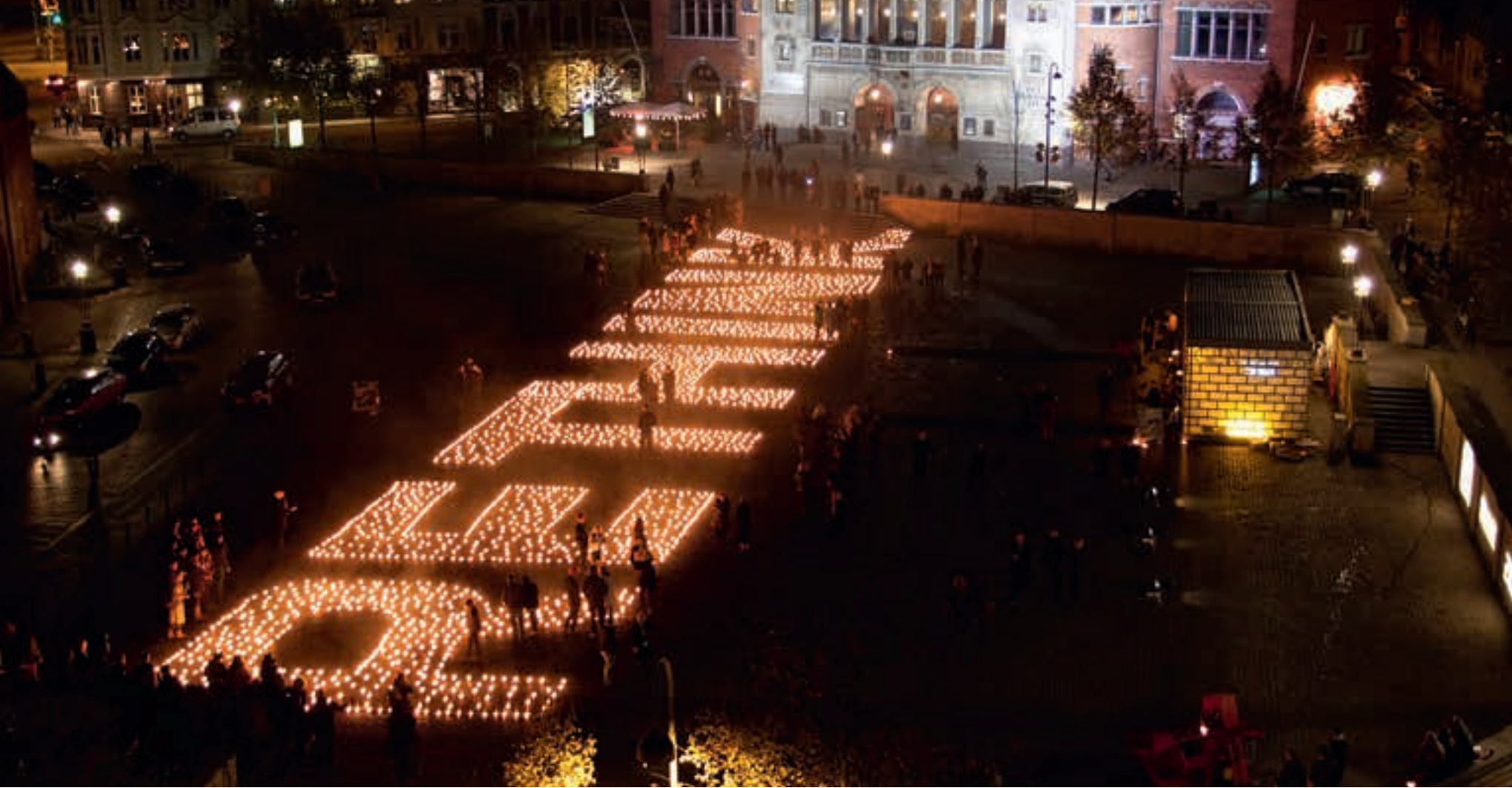
Aarhus 2017 — Rethink landscape

summer carnivals. ‘Neighbourhood weeks’ constituted themselves as an association and have continued to arrange the weeks every year. An accessibility project has been managed by the Arts Academy at Turku University of Applied Sciences, and now accessibility activities and education are strongly embedded in its syllabus.