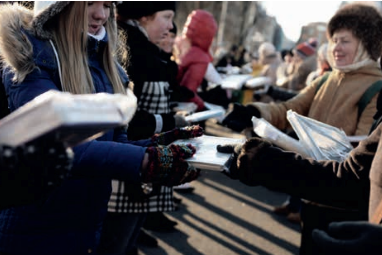
Riga 2014 — Chain of book lovers

During its evolution, the programme has encouraged a stronger commitment towards more closely-defined and locally-sensitive vision statements. It is important that the programmes not only correspond to the ambitions of the planners but also sit comfortably with the city's own population. This requires an acute consciousness of local culture — in every sense of the word — to ensure that the content of the programme and the creation or import of new cultural activities win the support of local communities, rather than generate disruption and associated tensions.