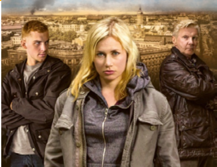
Tellus, 2014 – Producion Company: YLE, Finnish Broadcasting Company