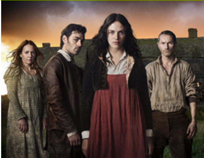
Jamaica Inn, 2014 – Production company: Origin Pictures