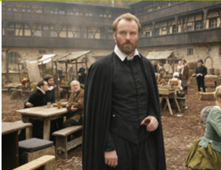
Die Seelen Im Feuer , 2014 – Production Company: Film Line Productions Filmproduktions GmbH (supported by the MEDIA TV Broadcasting scheme, 400.000 Euro)

Cathedrals of Culture , 2013 - Production Company: Neue Road Movies GmbH (supported by the MEDIA TV Broadcasting scheme, 300.000 Euro)