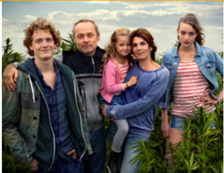
Hollands Hoop , directed by Dana Nechushtan, produced by Lemming Film, ARA, VPRO, NTR - 2014