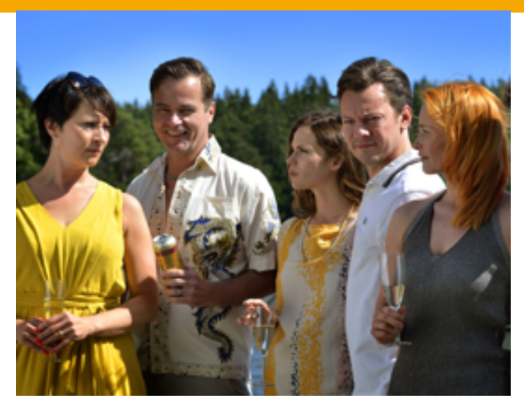
Mustat lesket (Black Widows), © Moskito Television/Else Kyhälä